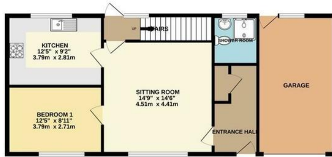
GROUND FLOOR 774 sq.ft. (71.9 sq.m.) approx.